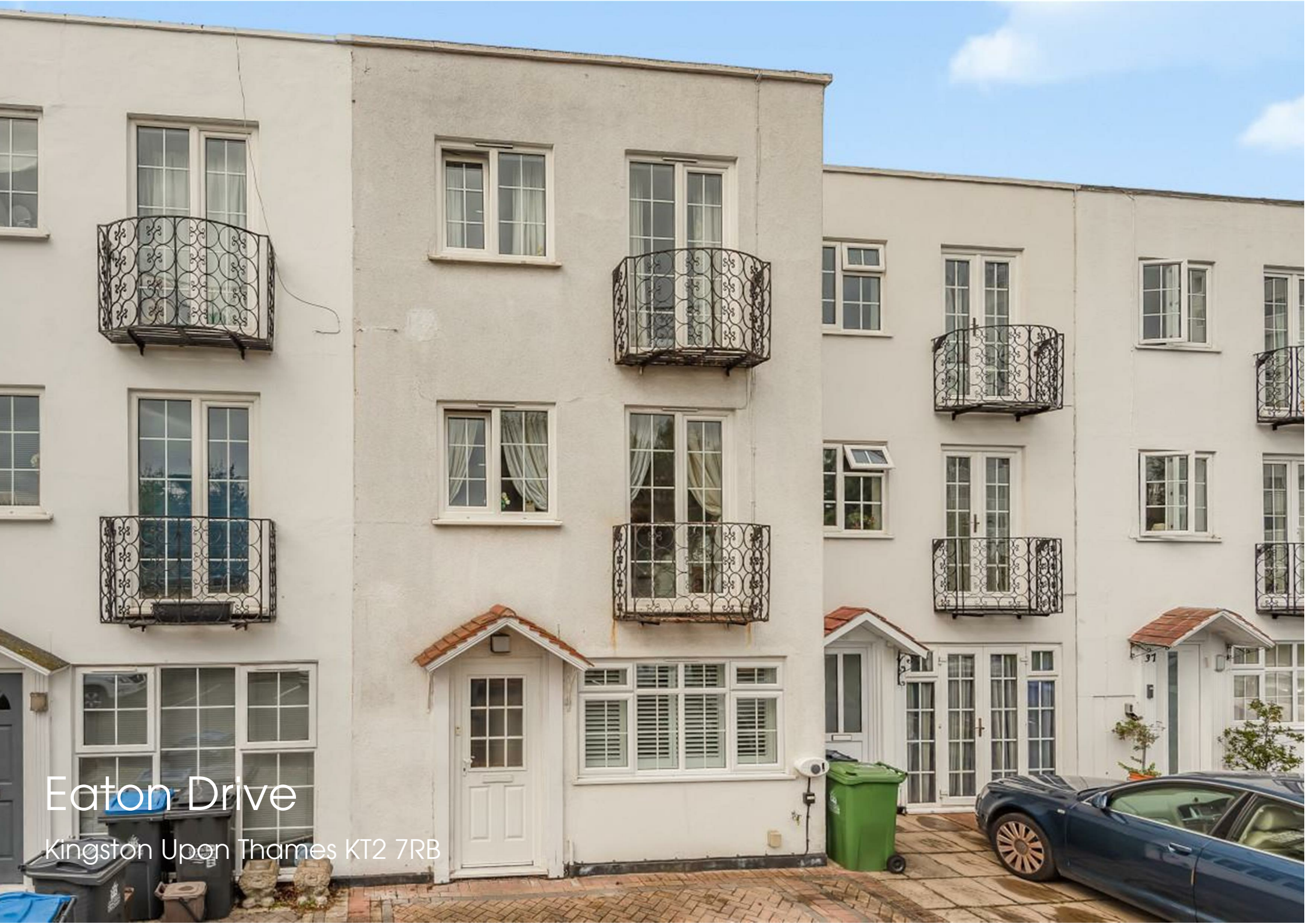
Eaton Drive Kingston Upon Thames KT2 7RB